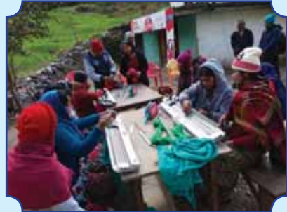
;lk ljsf; tfnd